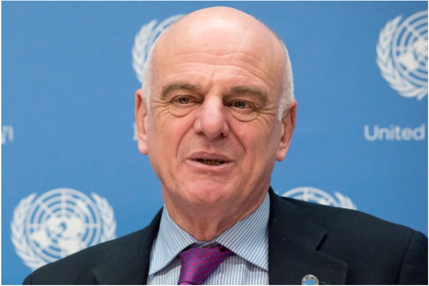
David Nabarro

Sign up for our special edition newsletter to get a daily update on the coronavirus pandemic.