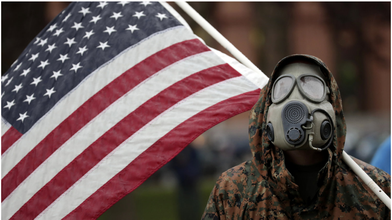
A protester attends a demonstration over Michigan's coronavirus restrictions on Thursday at the state Capitol in Lansing.