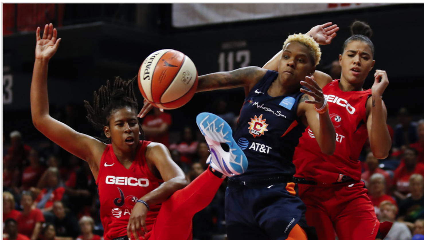
SPORTS Women's Pro Basketball To Return In July