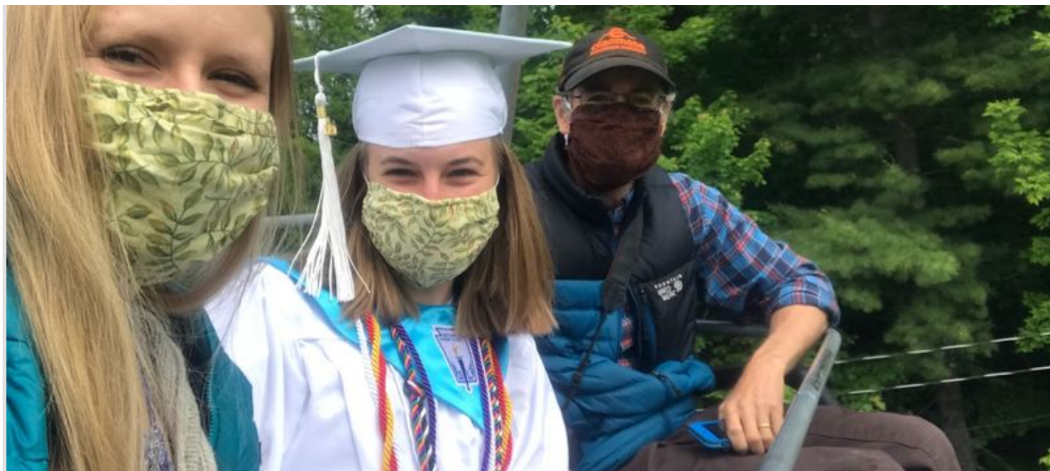
NATIONAL Ski Town Grads Ride The Chairlift To Collect Their Diplomas